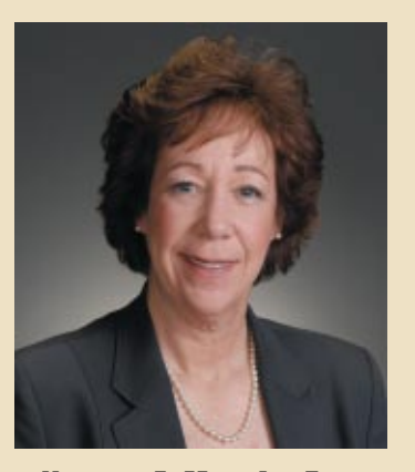
Noreen A. Murphy, Esq. 10 Converse Place Winchester. MA 01890

Note: Nothing in this publication is intended or written to be used, and cannot be used by any person for the purpose of avoiding tax penalties regarding any transactions or matters addressed herein. You should always seek advice from independent tax advisors regarding the same. [See IRS Circular 230.] © 2011 Integrity Marketing Solutions